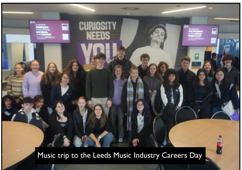
Music trip to the Leeds Music Industry Careers Day