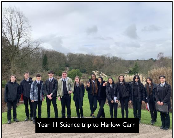
Year 11 Science trip to Harlow Carr