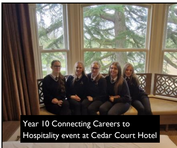
Year 10 Connecting Careers to Hospitality event at Cedar Court Hotel