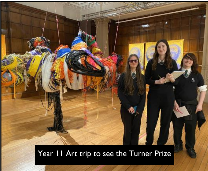
Year 11 Art trip to see the Turner Prize

This term has been packed with enriching experiences beyond the classroom. From an inspiring gallery visit to see this year's Turner Prize, to memorable theatre outings and engaging trips to a variety of places of interest, all carefully chosen to bring learning to life and support our students across their subjects.