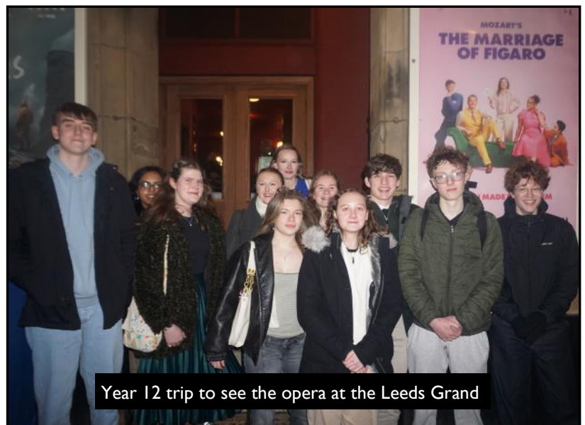
Year 12 trip to see the opera at the Leeds Grand